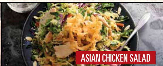
ASIAN CHICKEN SALAD

Claim Jumper is a 100% trans-fat free restaurant. Gluten-sensitive menu available, ask your server.