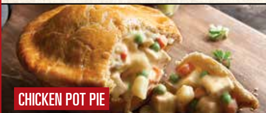
CHICKEN POT PIE