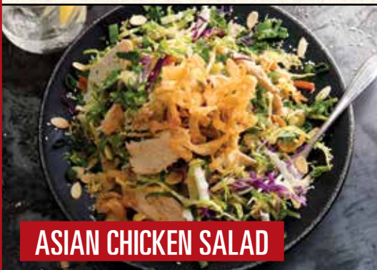
ASIAN CHICKEN SALAD