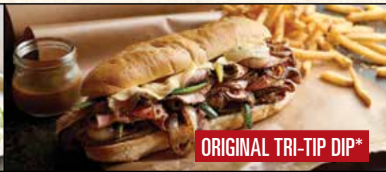
ORIGINAL TRI-TIP DIP*