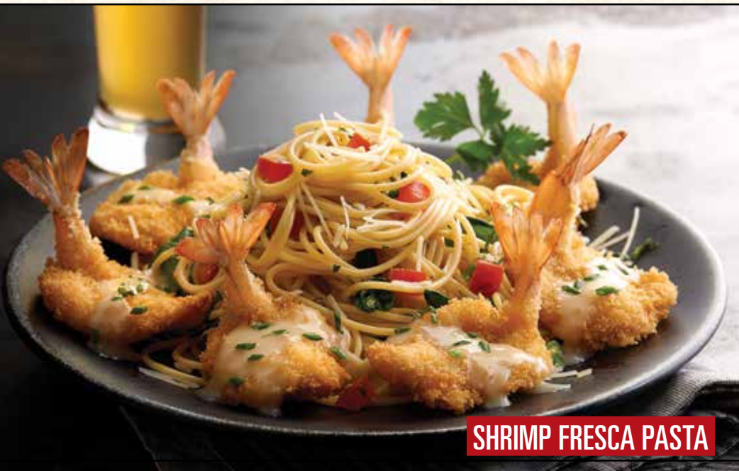
SHRIMP FRESCA PASTA

Cheese tortelloni, blackened chicken, bacon-tomato vodka cream sauce, shredded Parmesan 19.49