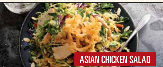
ASIAN CHICKEN SALAD

Claim Jumper is a 100% trans-fat free restaurant. Gluten-sensitive menu available, ask your server.