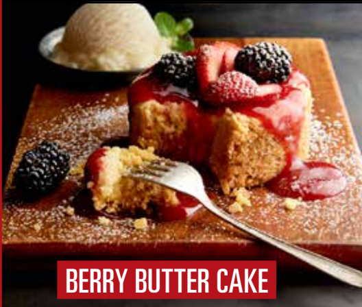
BERRY BUTTER CAKE