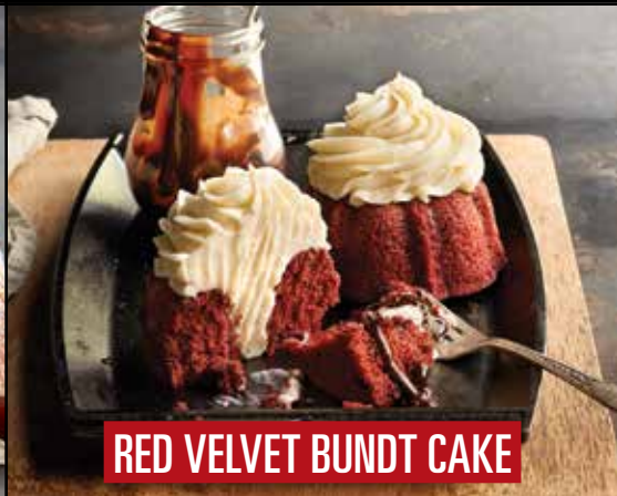
RED VELVET BUNDT CAKE