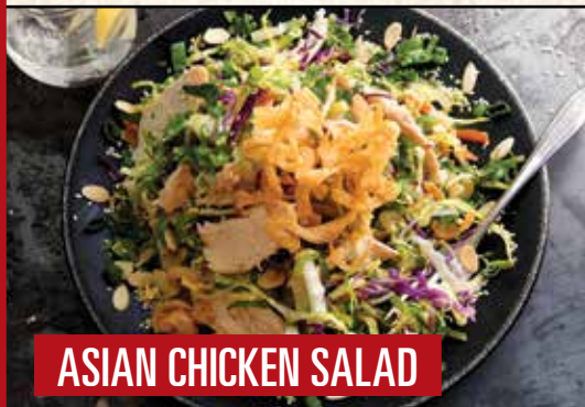
ASIAN CHICKEN SALAD