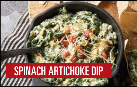
SPINACH ARTICHOKE DIP