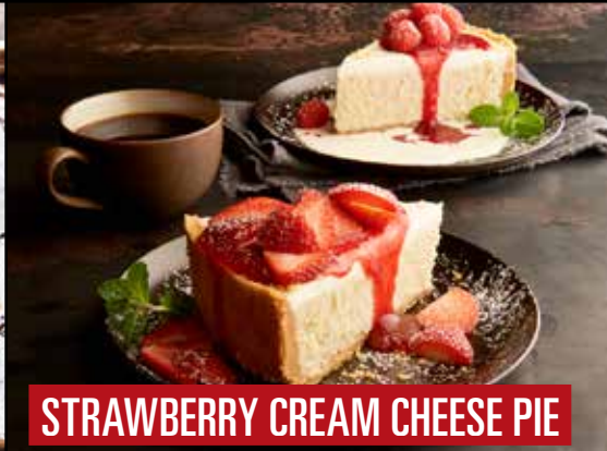
STRAWBERRY CREAM CHEESE PIE