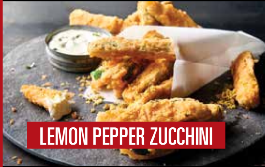
LEMON PEPPER ZUCCHINI