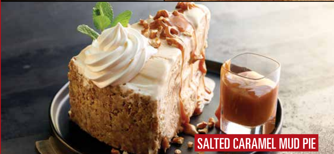
SALTED CARAMEL MUD PIE