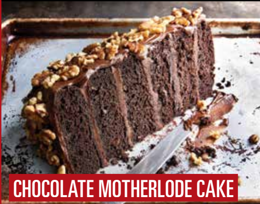
CHOCOLATE MOTHERLODE CAKE

Raspberry White Chocolate Cream Cheese Pie 8.99 Original Cream Cheese Pie 7.99