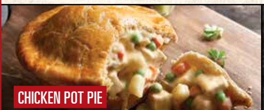
CHICKEN POT PIE