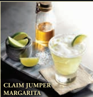
CLAIM JUMPER MARGARITA