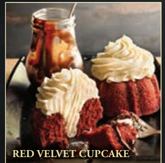
RED VELVET CUPCAKE