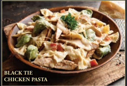
BLACK TIE CHICKEN PASTA