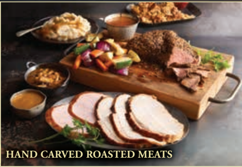
HAND CARVED ROASTED MEATS