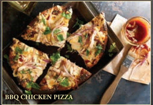
BBQ CHICKEN PIZZA